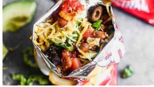
Walking Tacos $15