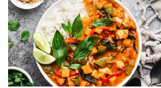
Red Curry $25