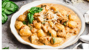
Creamy Chicken & Gnocchi $14