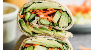
Veggie Wrap $10