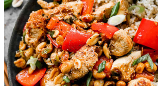
Kung Pao Chicken $12