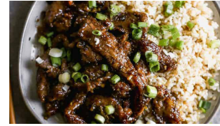
Mongolian Beef $13.00