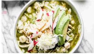
Pozole Verde $34.49