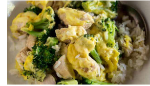
Chicken Divan $10.82