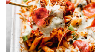
Pizza Casserole $16.94