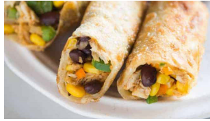
Southwest Egg Roll $11.68